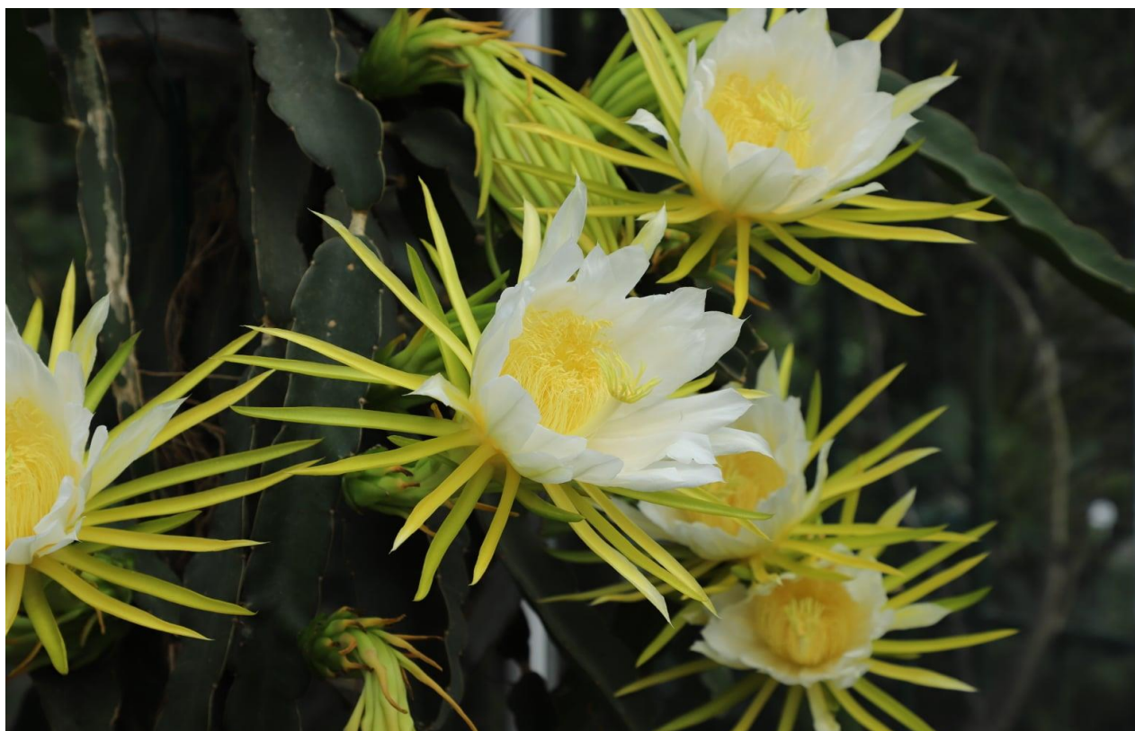
Hylocereus undatus (Haw.) Britton&Rose