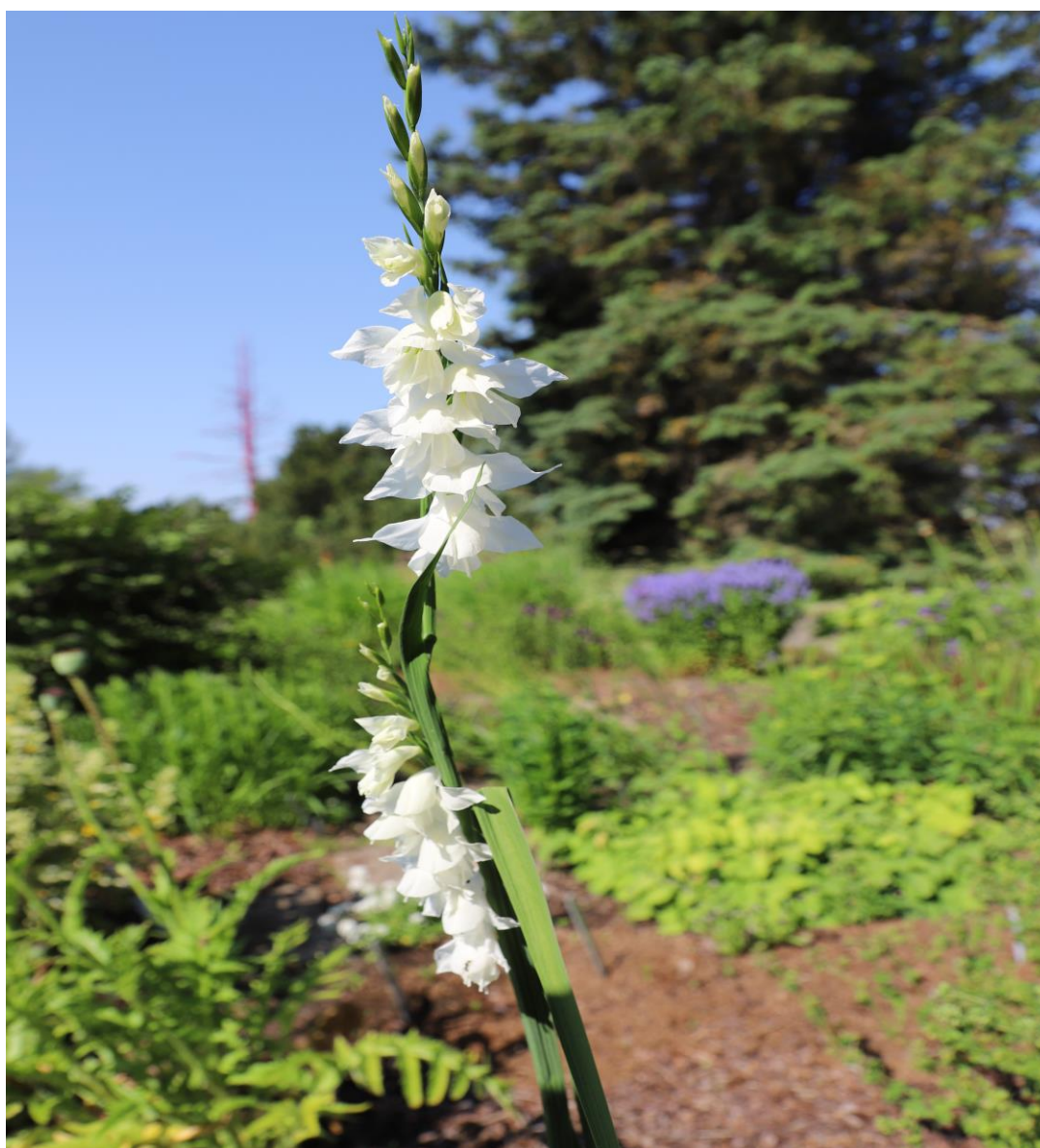
Gladiolus imbricatus white-flower specimen * (Nr.182 in catalogue)