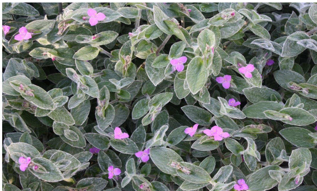
Tradescantia sillamontana Matuda