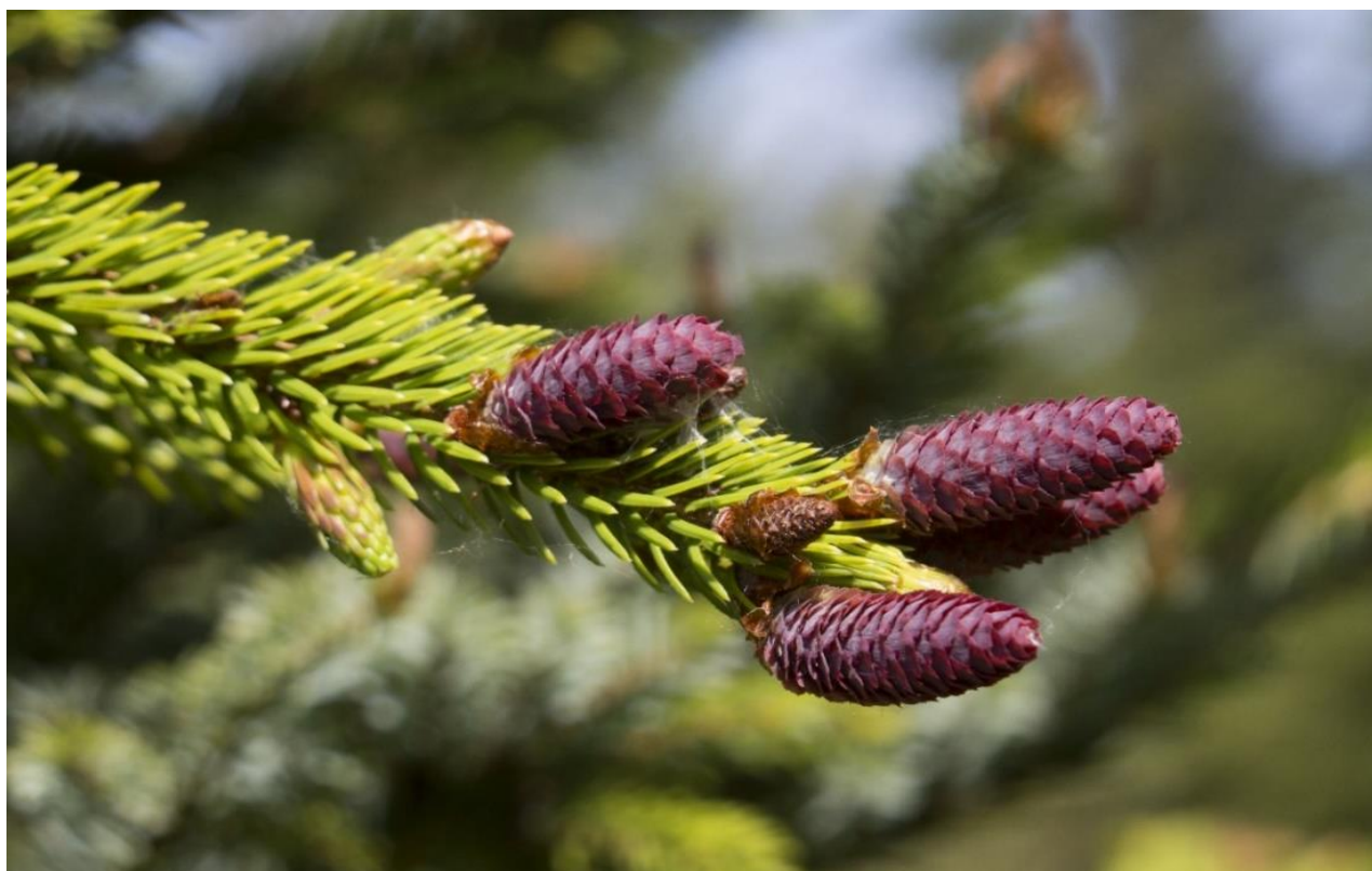
Picea jezoensis (Siebold & Zucc.) Carriere subsp. hondoensis (Mayr) P.A.Schmidt